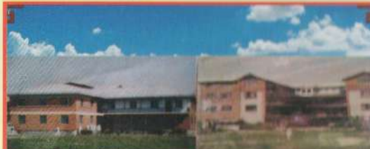
VISHWA BHARATI HIGHER SECONDARY SCHOOL, RAINAWARI, KASHMIR