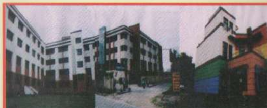
VISHWA BHARATI SCHOOL, GHAZIABAD, U.P