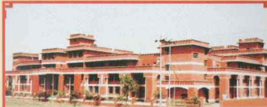
VISHWA BHARATI PUBLIC SCHOOL GREATER NOIDA