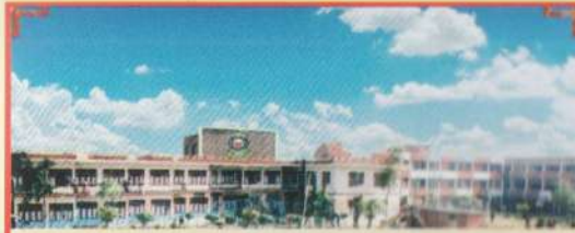
VISHWA BHARATI HIGHER SECONDARY SCHOOL, UDHEYWALLA JAMMU