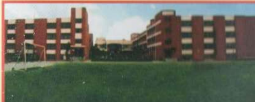
VISHWA BHARATI PUBLIC SCHOOL, ARUN VIHAR, NOIDA