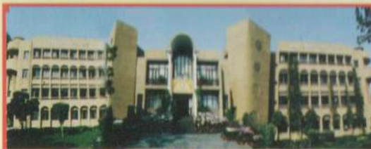
VISHWA BHARATI PUBLIC SCHOOL DWARKA, NEW DELHI