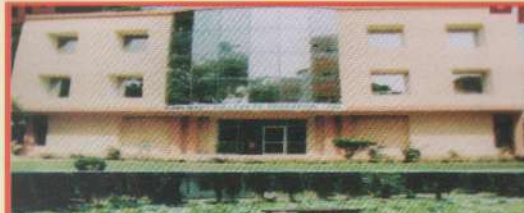
VISHWA BHARATI COLLEGE OF EDUCATION, JAMMU