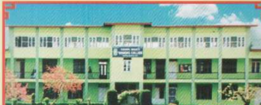
VISHWA BHARATI DEGREE COLLEGE, RAINAWARI, SRINAGAR